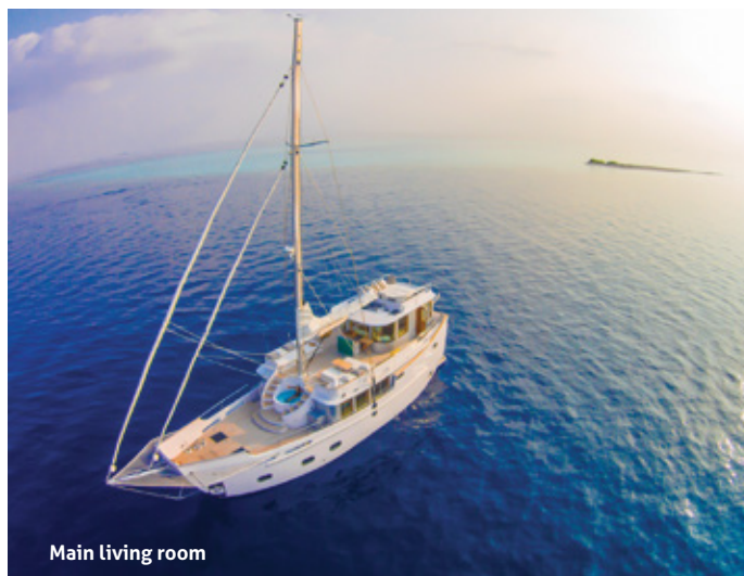
Main living room

A personalised itinerary designed by our Captain offers guests the chance to explore reefs beneath the calm waters, uninhabited islands and fascinating marine life at leisure.