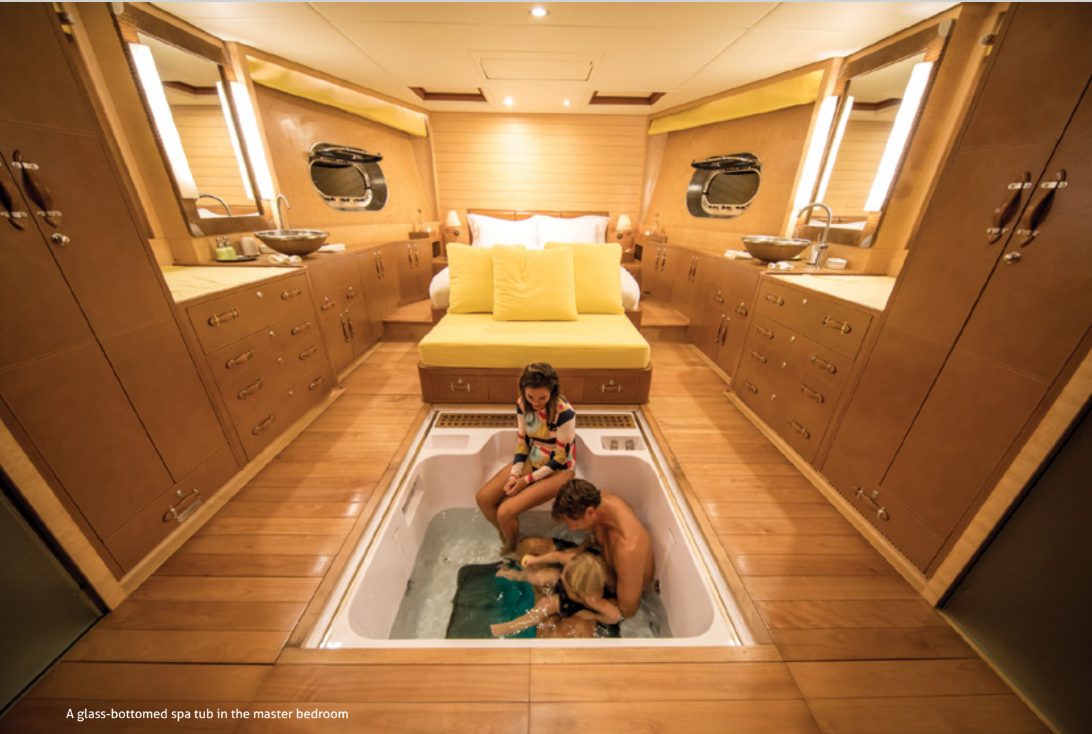
A glass-bottomed spa tub in the master bedroom