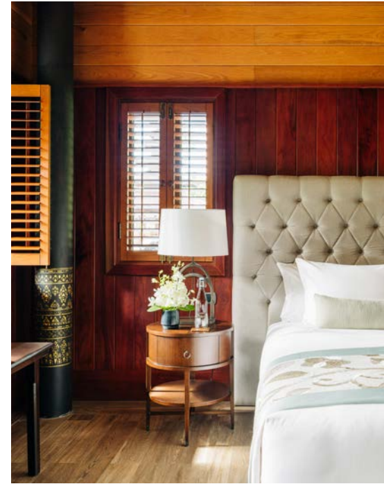
OCEAN VILLA (1,044 sq.ft / 97 sq.m)